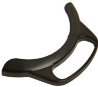
KFM LED Handles