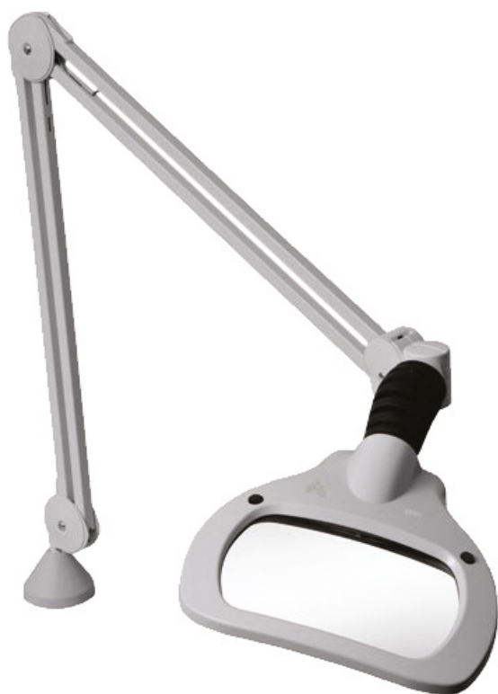
Wave LED / LED ESD / LED UV Magnification

Timer and dimming: Step dimming 0-50-100%. Selectable left / right illumination. Auto shut-off function.