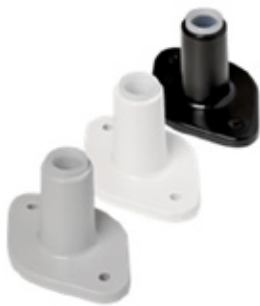
Surface Mounted Bracket