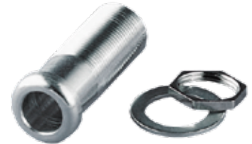
TE Table Bushing