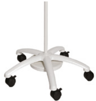
Floor Stand (Trolley) With Extra Weight