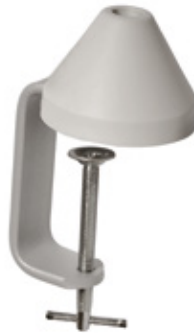
AH Mount Bracket